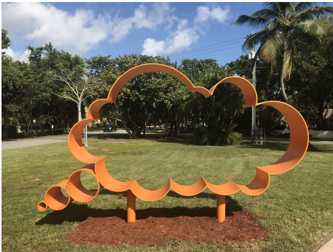
Saverio and Daisy (navel)

Both these pieces to be installed for full year and thru winter season-not on sidewalk or in where vulnerable to snow throw from sidewalk maintenance or snow storage area in front of gazebo.