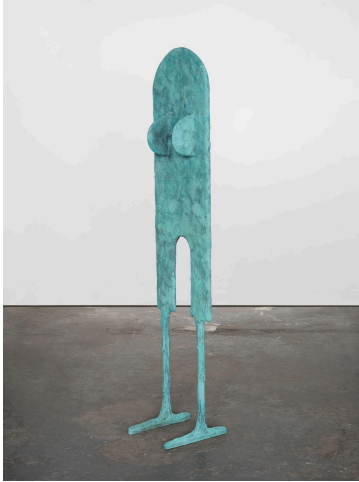
Good Enough Bronze Figure

Bronze and tempered glass 73 ½ x 15 x 16 in (200-300 lbs. each)